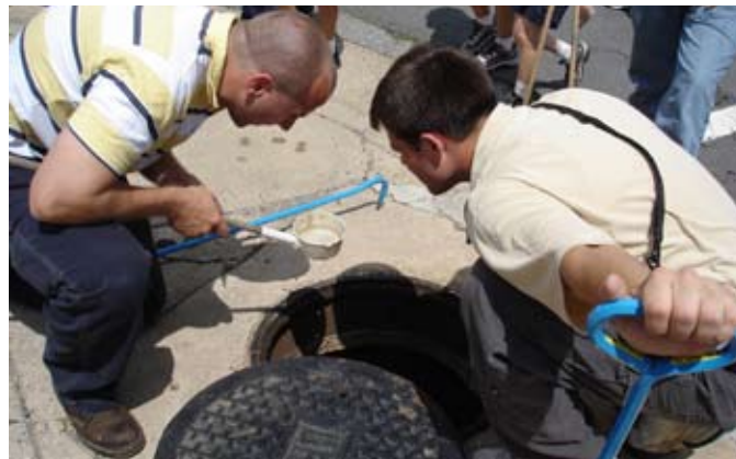
Catch Basin Check. Staff with the Alexandria, Virginia, Health Department check one of the city's 4,000 catch basins before dipping for mosquito larvae.

For the VectoMax™ trial, McGonegal chose 34 basins, six of which were combination units. Though the summer of 2008 was a bit drier than normal, he said, pre-treatment dip samples showed anywhere from 150 to 200 larvae and pupae in each of the basins.