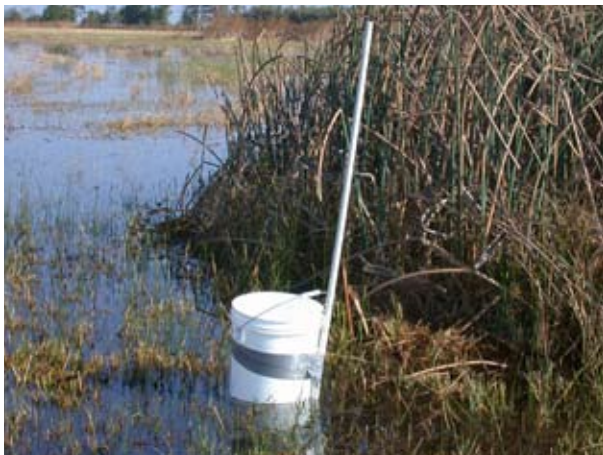
Application Accuracy. A bucket and stake mark one transect included in a VectoMax™ CG field trial. Cooperators noted broad-spectrum control and long residual activity.