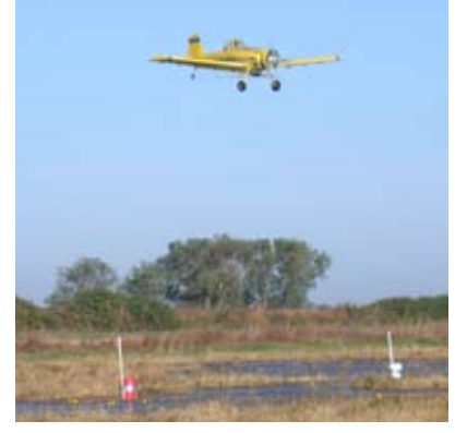
Aerial Application. An Air Tractor 401B applies VectoMax™ CG to a field-trial site in the Woodbridge Ecological Reserve near San Joaquin, California.