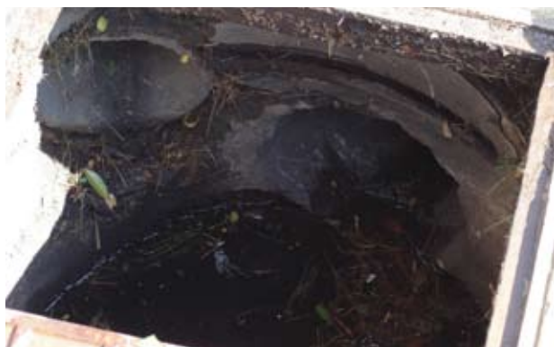
Organic Water. High organic content is observed in an Alexandria, Virginia, catch basin. A number of basins in Old Town hold both stormwater and sewage, creating a highly organic environment.

"We have many catch basins in our city – on the order of 4,000 – and a majority hold from four to 12 inches of water," he said. "Most of the basins are part of the stormwater system, but in Old Town area we have some that hold a combination of stormwater and sewage that creates a heavy organic environment."