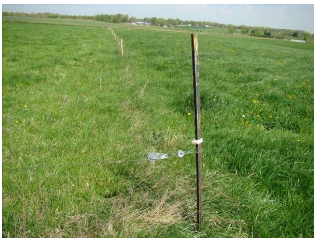
Untreated RyzUp SmartGrass