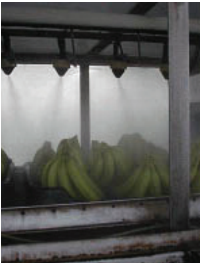
APPLICATION BY SPRAY

Prepare only the amount required during a 24 hour period.