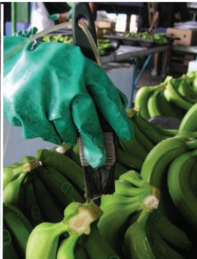
APPLICATION WITH BRUSH